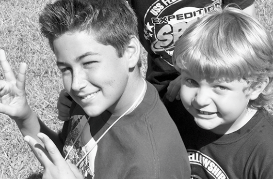
USS Fellowship cadets didn't let Wednesday's power failure stop them from having a great day exploring God's awesome universe. Training aboard their shuttlecraft, singing on the Main Bridge or playing on the realistic outdoor Holodeck - it was "ops normal."